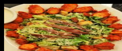
Italian Caesar Salad With Anchovies on Request $ 6.99