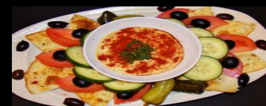
Greek Hummus Platter $ 7.99 Olive, Dolmade, Tomato, Pepperoncini