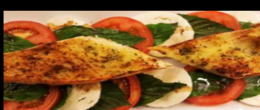
Caprese Salad $ 6.99 Danish Sour Fish or Austrian Sour Bologna $ 3.99