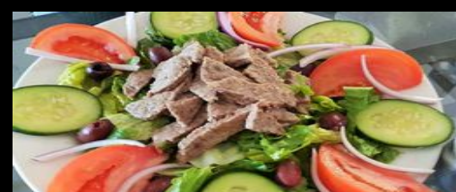
Greek Gyro Salad $ 7.99 Vietnamese Vermicelli Noodle Salad

>> Add Buffalo or Krispy BL Chicken or Bratwurst $ 3.00 or 7 Meatballs - Big Bacon Bits $ 2.00 <<