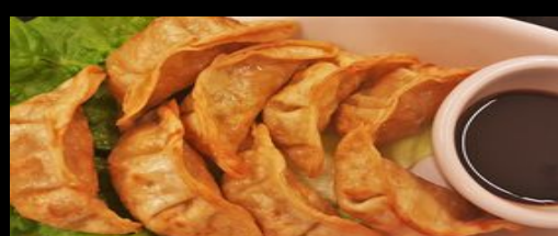
Japanese Gyoza Dumplings With our Magic Sauces $ 7.99