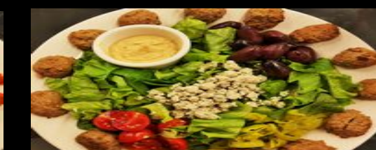
Greek Salad: Tzatziki or Hummus Kalamata Olives, Pepperoncini $ 6.99