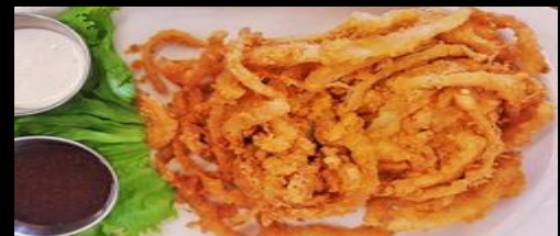
New York Onion Loaf BBQ Sauce and Ketchup $ 5.99