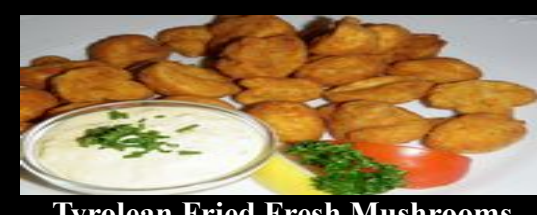
Tyrolean Fried Fresh Mushrooms or Zucchini & Tartar Sauce or Breaded Fried Pickles $ 6.99