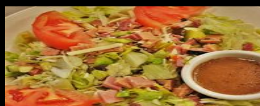
Croatian Antipasto Chop $ 7.99 Meats*, Cheese, Lettuce & Tomato