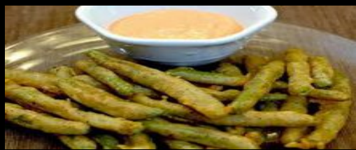
Battered Fried Green Beans Magic Tartar Sauce $ 4.99