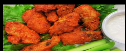
8 Sauced Chicken or Boneless Wings Ranch or Blue Cheese Dressing $ 5.99

SAUCES: BBQ*, Szechuan***, Sweet Chili* Teriyaki, Zesty-Orange*, Buffalo***