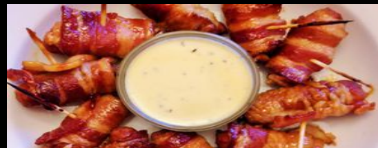
10 Pigs in a Blanket $ 8.99