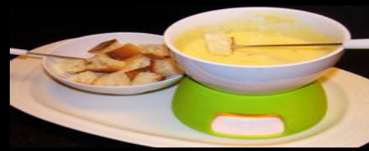
Swiss Cheese Fondue (G) For 2 ! Bread for Dipping $ 11.99