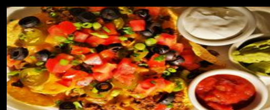
Mexican Beef Nachos (G) Guacamole, Sour Cream, Salsa $ 6.99