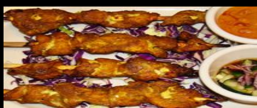
Nepalese Chicken Satay (G) Magic Peanut Sauce $ 6.99