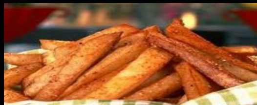
Seasoned Fries $2.49 ++ Cheese $ 2.99 With Chili $ 3.99 or Mexi-Fries $ 6.99