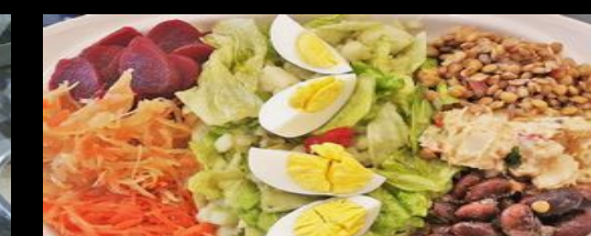
Mixed Salad Plate with Egg: Green, Potato, Lentil, Bean Sampler $ 11.99