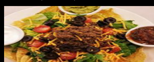
Taco Salad.....$ 7.99 Cantonese Chicken-Cabbage $ 3.99