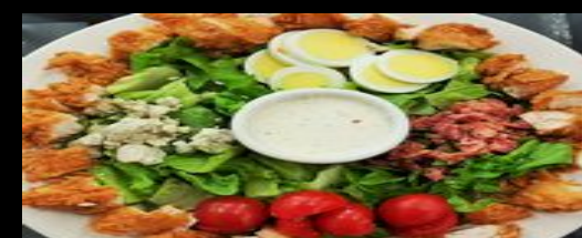
Cobb Salad: Bacon, Tomato, Egg, Blue Cheese Crumble, Avocado $ 6.99

>> Add Buffalo or Krispy BL Chicken or Bratwurst $ 3.00 or 7 Meatballs - Big Bacon Bits $ 2.00 <<