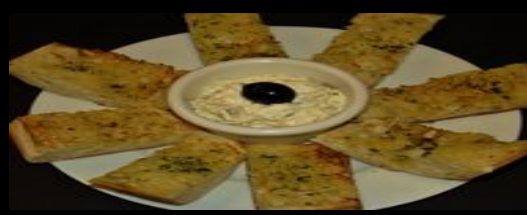
Mexican Jalapeno Artichoke Magic Garlic Bread $ 4.99